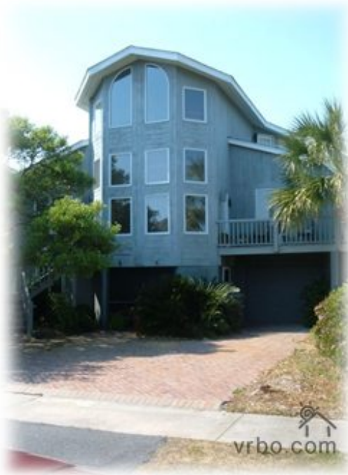
Your castle for a week

Welcome to the beautiful Isle of Palms. Our beach house is located across the street from one of the most inviting beaches on the East Coast with easy beach access. The house is surrounded with decks allowing you to enjoy ocean breezes and has a large yard for grilling out, lounging in a hammock, or many other outdoor activities. You are located just blocks from the Isle of Palms Marina which provides a boat ramp and trailer parking, so feel free to bring your boat.